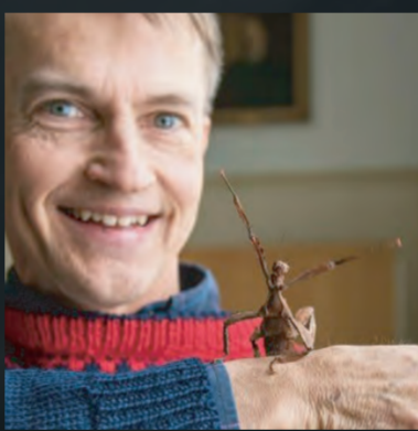
Fredrik Ronquist Swedish Museum of Natural History, Sweden Phylogenetic Systematics